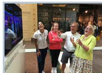
Sky and Wasserman