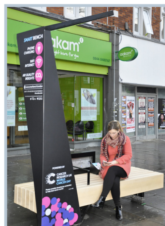
Cancer Research UK with MKTG

Goodbye to all that - shredding cigarettes