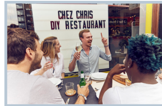
IKEA by Hope&Glory