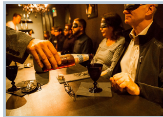
Cobra by Sense