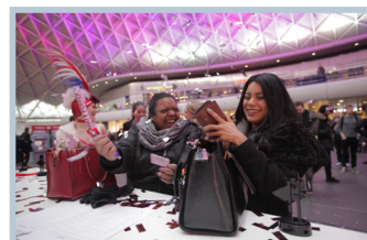
Love Vegas