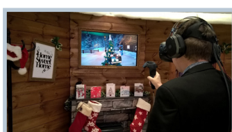
Christmas with intu at the Victoria Centre