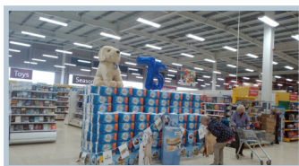
Andrexx by McCurrach