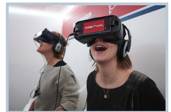
Norwegian with MKTG