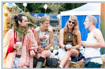
Co-op with iD