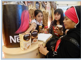
Nestle with Powerswitch in Indonesia

These are all moments of engagement – and we expect the pictures to do the talking in this one – so the captions are brief.