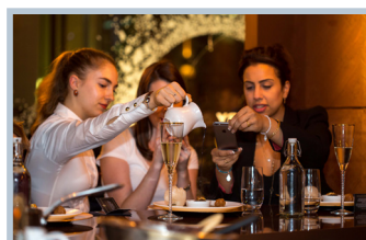
Ferrero Rocher by TracyLocke