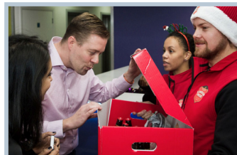
Fuller's with Circle