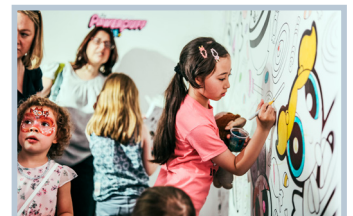
Powerpuff promotion by Produce

Where contentment and engagement overlap