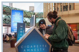
Blu with whynot

Goodbye to all that - shredding cigarettes