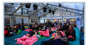
Vaillant with Circle