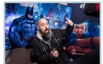
Playstation with Circle