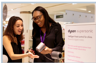
Dyson with Mash