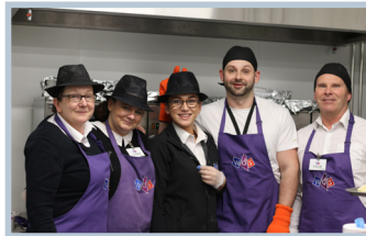
Costco/ Fizz Experience