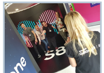
Samsung (S8 Roadshow)/ Undercurrent