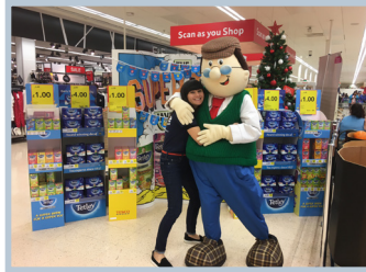
Tetley/ REL Field Marketing