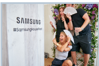
Samsung (House)/ Undercurrent