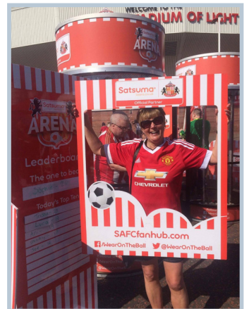
Satsuma/ Banana Kick