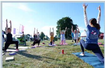
Dorset Cereals (yoga)/ Circle