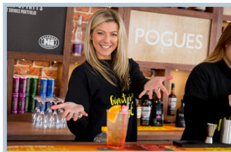
Crabbies/ Independent Events