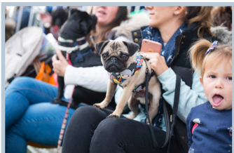
More Th>n/ CSM Live