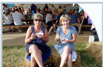
Dorset Cereals (duo)/ Circle